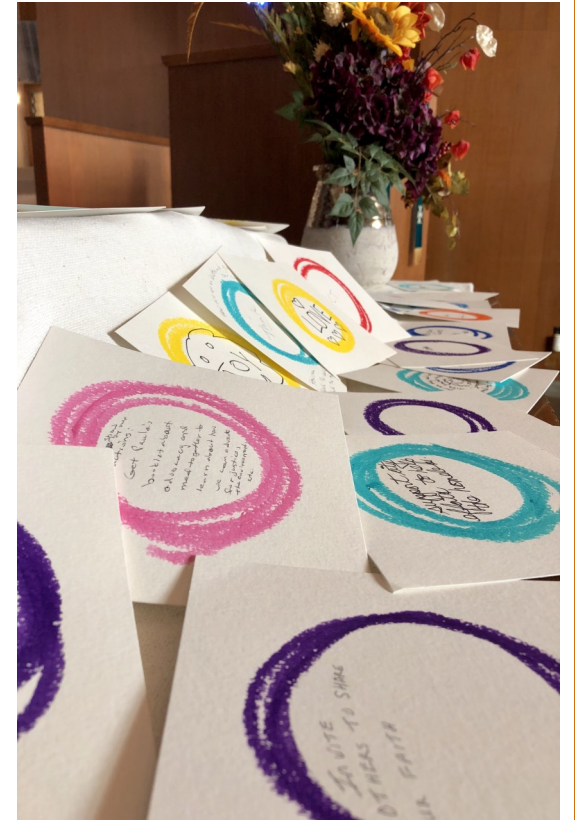
Interactive Prayer Cards from Sunday