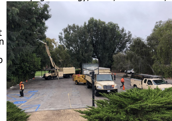
Tree Trimming (September 2018)